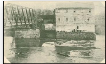
Above: Rock Dam Mill at Rt66, Carpenters Park. Below: building the first roads in Original Sherman.

For more of our history please visit us at: https://www.shermanil.org/about/village-history/ .